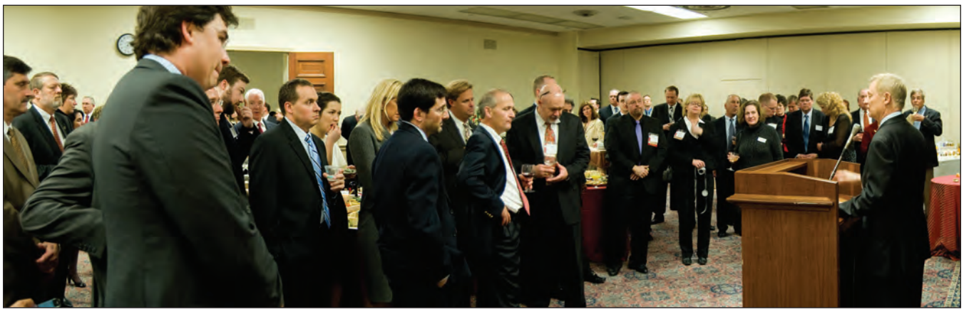
▲ U.S. Representative Spencer Bachus (R-Alabama) talks to Federal Conference attendees during the Capitol Hill reception on Tuesday Night.