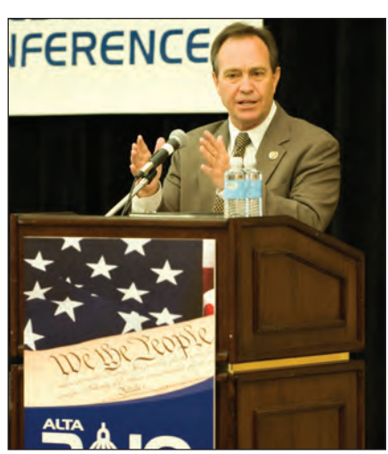
▲ U.S. Rep. Ed Perlmutter (D-Colorado) provided a timeline of the mortgage meltdown and rational steps the Federal government has taken to resurrect the financial system.