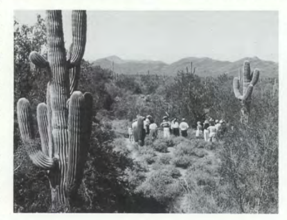
Top, left, the Saguaro cactus, familiar sentinel in the Arizona desert. Golf is a favorite pastime in the Valley of the Sun (top, right). In the center photograph, a group enjoys the natural beauty from a close-up perspective. Below, the Scottsdale Princess, a Five Diamond facility and site of the 1994 ALTA Mid-Year Convention.