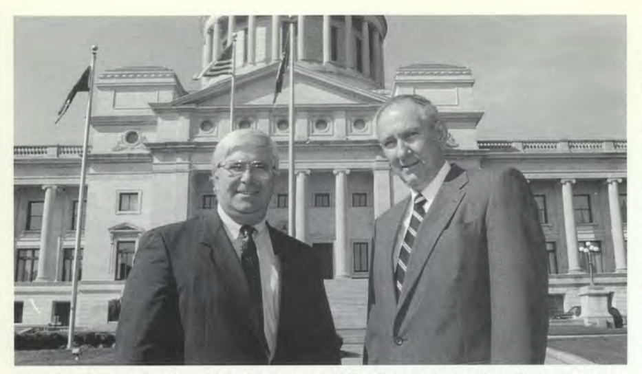
State Senator Jon Fitch confers with Representative Curran on the State Capitol grounds.

members of both parties as members of Congress address issues and engage in election campaigns.