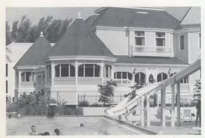
The Casa Ybel Beach and Racquet Club on Sanibel Island, Florida, offers direct views of the Gulf of Mexico.

In August 1982, the NTC Board of Governors met in Orlando, Florida, to amend the model act. The meeting was called in reaction to a recent Florida timeshare bankruptcy case in which a federal judge issued a ruling denying protection under bankruptcy laws to right-to-use timesharers. The