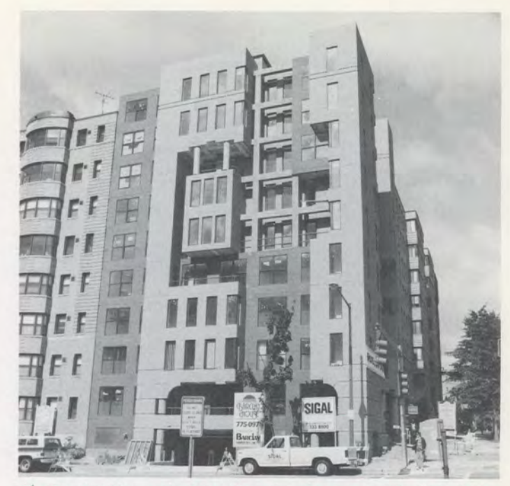
The Barclay House, the first urban timeshare project built in Washington, D.C., has 27 units owned primarily by businesses.

Looking to the future, NTC officials report that other federal agencies may become involved in regulating timeshares. Those agencies include the Federal Emergency Management Agency,