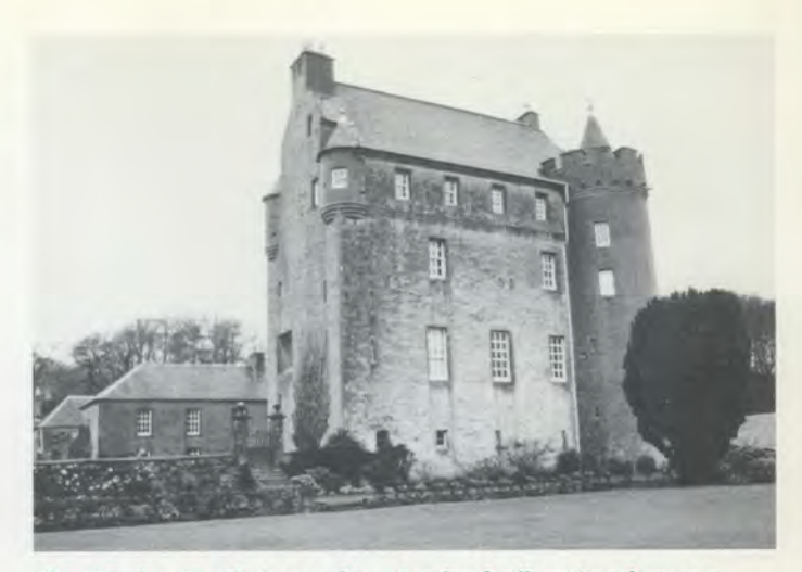
The Kilochan Castle in Ayrshire, Scotland, offers timesharers a taste of European elegance.

The taking of a tenants-in-common interest in a whole project, such as a hotel or a recreation facility, should be insured by a title insurance company in the same manner as any other tenants-in-common interest. The project timeshare must contain, coupled with the tenants-in-common interest, provisions for a right of occupancy within the project, the right being only a right to occupy some unit for some period either specified and set aside or on request. The possibility of insuring the right to occupy along with the tenants-in-common interest depends on the creating document and the particular