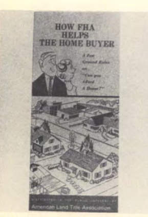
HOW FHA HELPS THE HOME BUYER. This public education folder was developed in cooperation with FHA and basically explains FHA-insured mortgages and land title services. $5.50 per 100 copies.

(CENTER) PERSPECTIVE: AMERICA'S LAND TITLE INDUSTRY. A collection of six articles by experts that comprehensively explain the land title industry and its services. This attractive booklet is available at 35 cents per copy for 1-48 copies and 30 cents per copy for 49 or more copies. (RIGHT) THE AWARD-WINNING ALTA FILM, "A PLACE UNDER THE SUN." Eye-catching color animation and an excellent script bring the story of the land title industry and its services to life in this highly-praised 21-minute sound film. Prints may be obtained for $135.00 each.