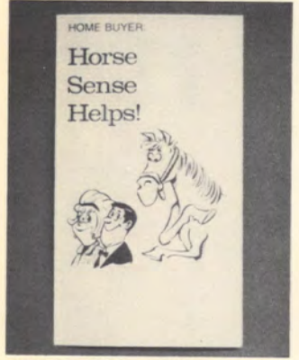
HOME BUYER: HORSE SENSE HELPS! A concisely-worded direct mail piece that quickly outlines title company services. 1-11 dozen, 65 cents per dozen; 12 or more dozen, 50 cents per dozen; designed to fit in a No. 10 envelope.

(All orders plus postage; write Business Manager, ALTA, 1828 L Street, N.W., Washington, D.C. 20036)