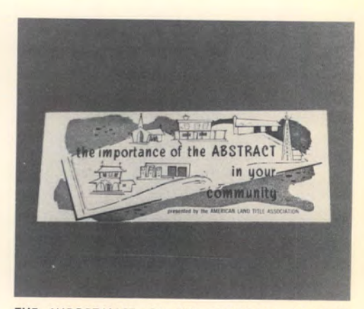
THE IMPORTANCE OF THE ABSTRACT IN YOUR COMMUNITY. An effectively illustrated booklet that uses art work from the award-winning ALTA film, "A Place Under The Sun", to tell about land title defects and the role of the abstract in land title protection. Room for imprinting on back cover. $12.00 per 100 copies.