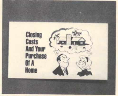
CLOSING COSTS AND YOUR PURCHASE OF A HOME. A guidebook for home buyer use in learning about local closing costs. Gives general pointers on purchasing a home and discusses typical settlement sheet items including land title services. 1-11 dozen, $2.25 per dozen; 12 or more dozen, $2.00 per dozen.