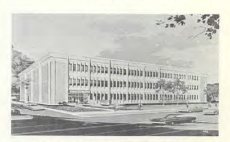
Artist's rendering of Security Title Insurance Co.'s new building in the San Fernando Valley.

Ground was broken in March for a $2.5 million state headquarters office building in California's San Fernando Valley for Security Title Insurance Co. of California. Completion is set for next February. The three-stories and basement