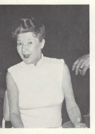
rrounded by happy conventioneers tah Land Title Association opens