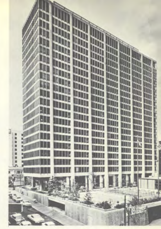
ABOVE: Tallest building in Oregon, the Portland-Hilton Hotel, is the site of ALTA's 1968 annual convention.

LEFT: Columbia River Gorge. A drive along this valley passes eight waterfalls and eight state parks in just eleven miles.