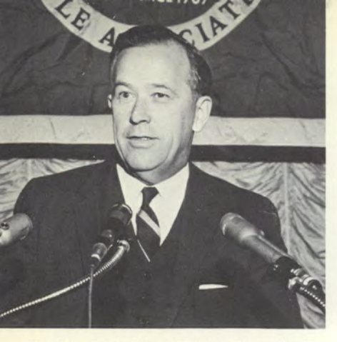
Members responded enthusiastically to the dramatic speech by U.S. Senator Henry M. Jackson.