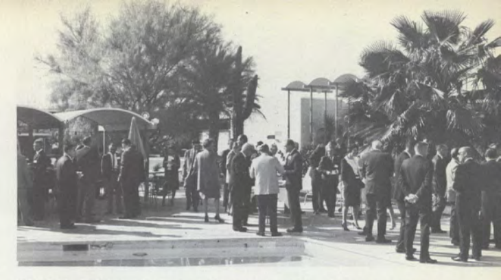
COFFEE BREAK TIME AROUND THE POOL DURING THE ANNUAL LAND TITLE ASSOCIATION OF ARIZONA CONVENTION.