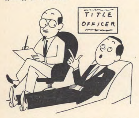
No. You don't have a complex. You are inferior.

Because people who want a title search or an abstract always seem to be in a tremendous hurry, fast accurate service is vital. This new equipment plays an important part in giving it to them.