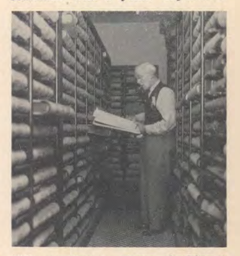
Title searcher is shown checking a title in one of the many huge volumes of documents filed in the vault.

The veteran title searchers have been trying for some years now to get the Legislature to pass a law which would provide licensing for searchers with 5 years' experience.