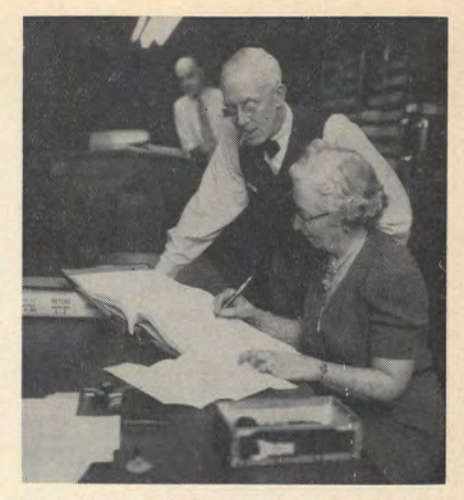
Searcher's job is eased somewhat by checking indexes of filed documents maintained for this purpose by County Clerk's staff.

The piece of land in question belonged to a whole string of individuals from 1850 until 1936, when it was conveyed to a real estate development firm. A year later the property was deeded to the Borough of Fair Lawn, which in turn sold it to another developer. The land now belongs to a home owner in Radburn.