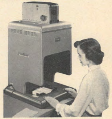
The Recordak Junior Microfilmer—one of 6 models designed for copying office records.

"One Call" Service. Recordak is an authorized Filmsort distributor. Just call your local Recordak representative and see all the ways you can save with Recordak Microfilming