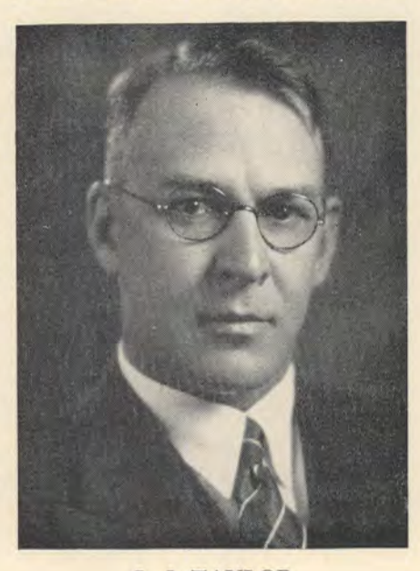
L. J. TAYLOR

Because of the fact that the courts will favor a construction creating a covenant instead of a condition subsequent, it is almost essential that an action in court be maintained first, to determine whether the wording creates a condition subsequent or whether it