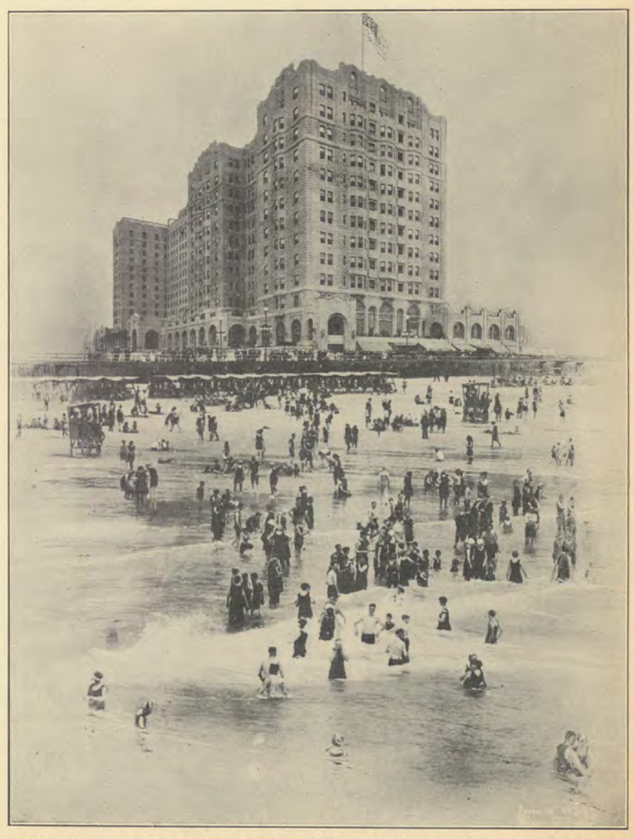
VIEW OF AMBASSADOR HOTEL—BATHING BEACH AND BOARD WALK The Ambassador has been selected as the place of meeting for the 1926 convention to be held in Atlantic City, N. J., Sept. 7-8-9-10.

It would be a fine thing for every state association to have such a committee, if said committee would function as the Oklahoma one does.