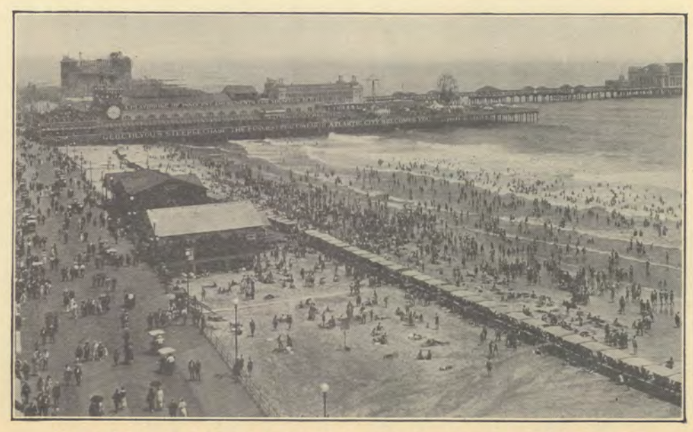
View of Pier, Beach and Board Walk, Atlantic City, N. J. Will you be in a similar throng at this spot at the Convention next September?

One compiling abstracts gets interested in the upbuilding of the City in which he or she lives. It is an ever changing excitement, going from one piece of property to another. Many funny things happen in the business and lots of grief too, if one is not careful. Again, the abstract business keeps one posted on what part of the city is increasing in value, it is information invaluable to one who speculates in real estate, and affords the opportunity of making added earnings by wise real estate investments.