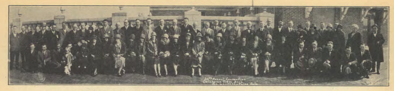
THE 1926 CONVENTION OF THE OKLAHOMA TITLE ASSOCIATION HELD IN TULSA.