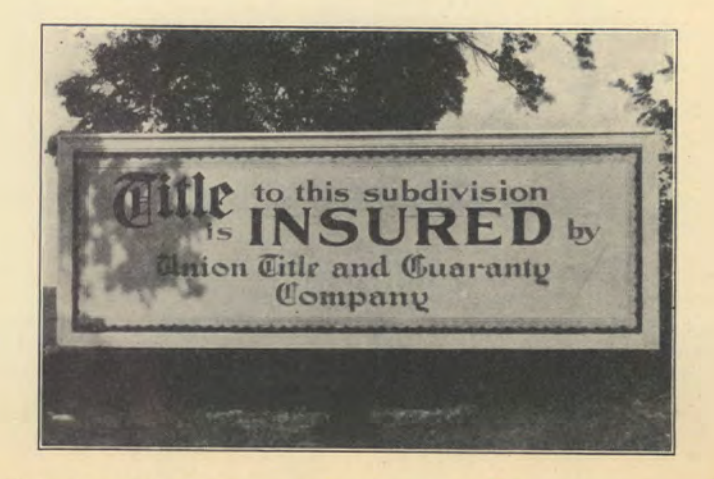
(This kind of a signboard on sub-divisions should help promote lot sales.)

(A very commendable example of printed publicity, newspaper or pamphlet.)