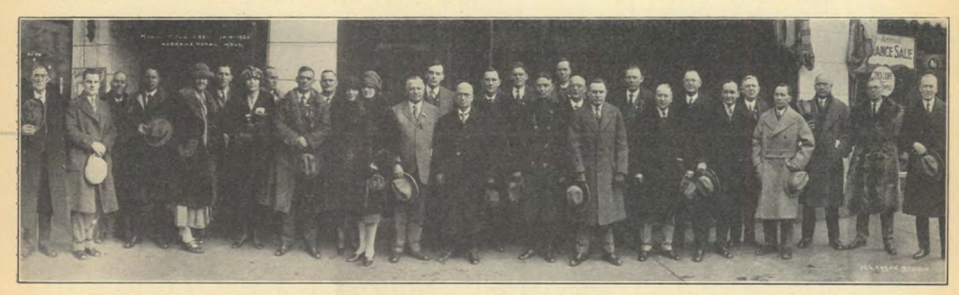
THE 1926 CONVENTION OF THE MINNESOTA TITLE ASSOCIATION HELD IN MINNEAPOLIS.

The hospitality and entertainment provided by the Minneapolis Abstracters and the Civic & Commerce Association added much to the success and spirit of the convention.