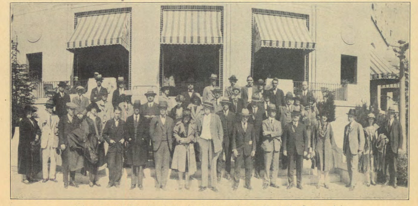
Arkansas Land Title Association Convention, Arlington Hotel, Hot Springs, Ark.

This was the first time a meeting had been held in Hot Springs, and plainly demonstrates the advisability of holding meetings in a place of real interest and attraction. Hot Springs is one of the most beautiful and delightful places in all America. The hotels are excellent, and there is not only much to do and see and enjoy, but